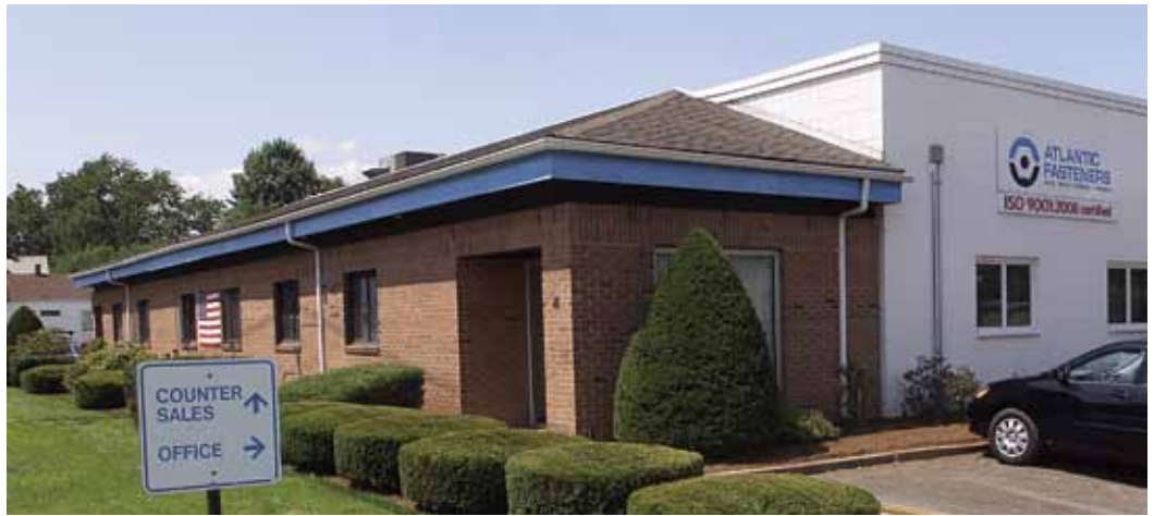
Atlantic Fasteners headquarters at 49 Heywood Ave., West Springfield, MA 01089.